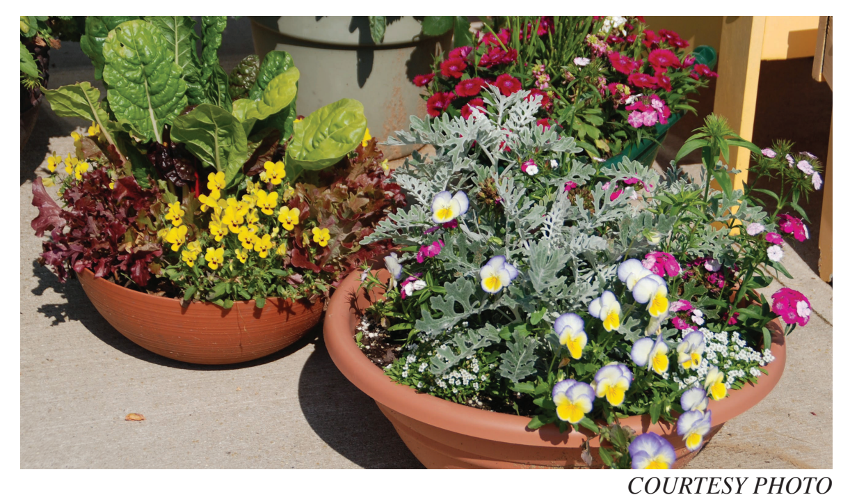
The right potting mix will help ornamental and edible plants thrive.