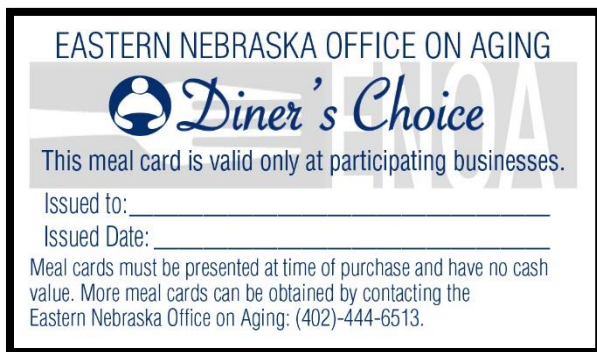
FRONT OF CARD

The Meal Card will be your “payment” at any Hy-Vee Grocery store located in Omaha, Papillion, Fremont and Plattsmouth. You must sign and date the back of the card when you receive your meal. You will not need to make any payments to Hy-Vee for the Diner’s Choice meal unless you order additional food not listed on the approved menu.